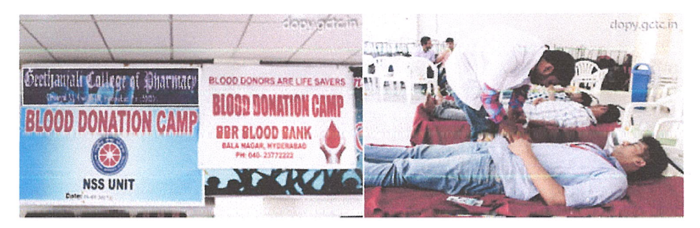
Blood donation at Geethanjali college of pharmacy

Geethanjali College of Pharmacy -NSS Units conducted Blood Donation Camp in collaboration with BBR Blood Bank, Balanagar, Hyderabad. The programme has been scheduled at 10:30 AM at Geethanjali college of Pharmacy seminar hall block no-I. Many of the students came forward to donate the blood and faculty also donated the blood. The event was a grand success.