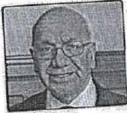
Mr. Virendra Sharma Member of the Parliament from Ealing Southall, United Kingdom.