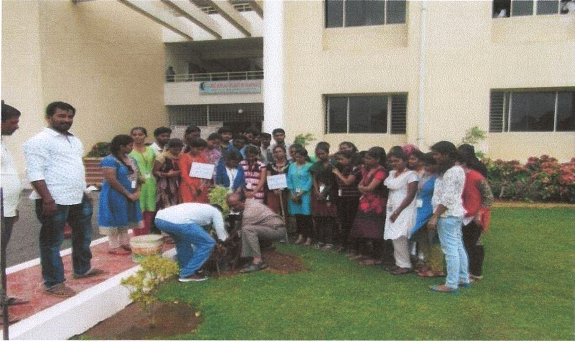
Haritha Haram Program- 2021