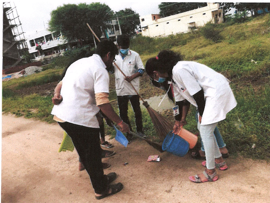
Swachh Bharath- 2021

Signature of PRINCIPAL Geethanjali College of Pharmacy Cheeryal (V), Keesara (M), Medchal Dist. (T.S)-501 301