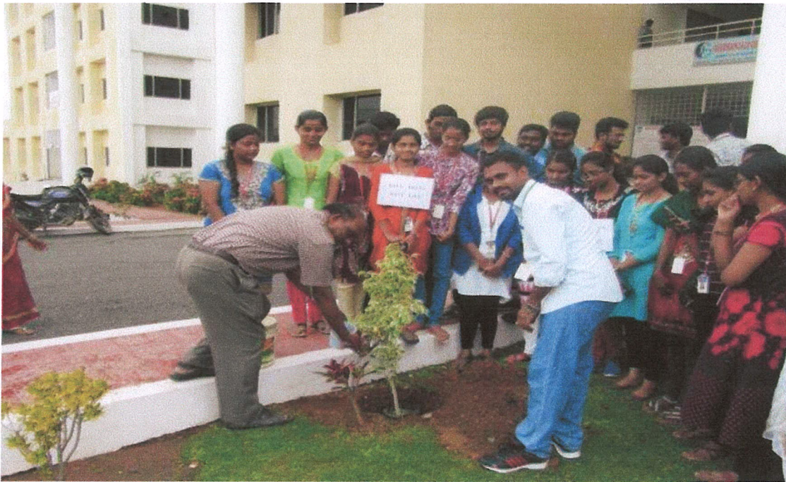
Haritha Haram Program- 2021

Handwritten signature PRINCIPAL Geethanjali College of Pharmacy Cheerval (V), Keesara (M), Medchal Dist. (T.S.)-501 301