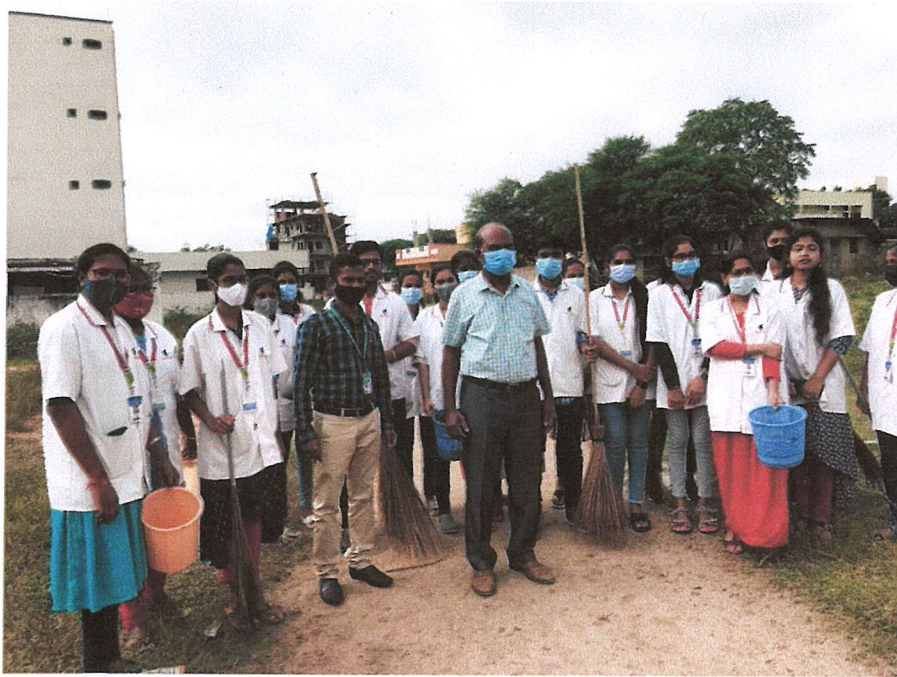
Swachh Bharath- 2021