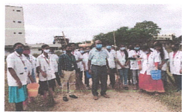
Principal sir active participation in Swachh Bharat.

Geethanjali College of Pharmacy-NSS Units conducted a Swachh Bharat in Cheeryal Village at 09.30AM on 22/11/2021. Students came forward to clean the village during the camp which included teaching staff. All the B.Pharmacy III year students actively participated and cleaned the roads of the Cheeryal village and our beloved principal sir also participated in the event and made the event grand success.