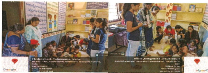
Students' interaction with parents and children in anganwadi

Geethanjali College of Pharmacy-NSS Units conducted Family Welfare and Nutrition-Awareness Program in Dundigal Municipality at 10.00AM on 17/12/2021. The students of B. Pharmacy III year attended the event and educated the parent and child in anganwadi of Bahadurpally, Dundigal. Explained regarding malnutrition and discussed about the food plane and vitamin deficiency regular seen in children.