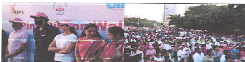
Pink ribbon campaign at KBR park.

Geethanjali College of Pharmacy and Geethanjali college of Engineering and Technology -NSS Units conducted "Pink Ribbon Campaign" in collaboration with "KIMS Hospital". The programme has been scheduled at 09:00 AM at KBR Park, Hyderabad. All the students actively participated in the campaign. The chief guest for the event is D. Rana (Film Actor) and Kalvakuntla Kavitha (Telangana party leader) participated in the campaign. The event was a grand success.