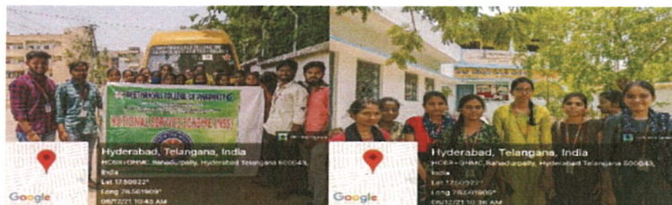
Our college students at ZPHS

Geethanjali College of Pharmacy-NSS Units conducted The Blue Challenge- Programme Aims to Inspire Students in Dundigal Municipality at 10.30AM on 06/12/2021. All the students of B. Pharmacy III year attended the event. The programme aims to inspire students aged 16 to 18 about sustainable finance and help them develop core competencies such as teamwork, problem-solving and entrepreneurial skills. Our college students interacted with the high school students of ZPHS and explained regarding the teamwork, problem-solving.