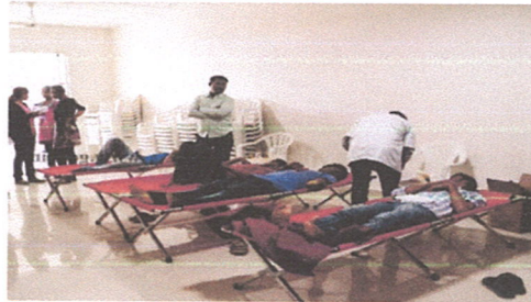
Students donating blood.

Geethanjali College of Pharmacy -NSS Units conducted " Blood Donation Camp " at Geethanjali College of Pharmacy seminar hall block no I in collaboration with Lions Club of Jubilee Hills . Students and faculty came forward for donating blood. The programme was grand success.