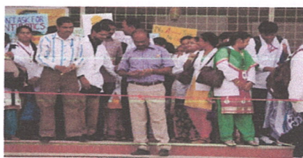
Inauguration of rally by principal sir and rally with placard presentation.