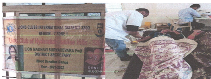
Blood Donation by students of GCP

Geethanjali College of Pharmacy and Geethanjali college of Engineering combinedly conducted Blood Donation Camp in Geethanjali College of Engineering, block no II seminar hall-I, on 14/12/2021. Students came forward for donating blood, faculty and principal sir also participated in the event. Blood donation camp has been organized in collaboration with "Lions Club of Hyderabad Jubilee Hills 320-D". Faculty and students came forwarded and donated the blood and made the event grand success.