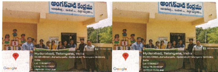
Our college students at anganwadi.

Geethanjali College of Pharmacy-NSS Units conducted "Personal Hygiene Awareness for Women" in anganwadi Bahadurpally, Dundigal Municipality at 11.00AM on 29/11/2021. The students of B. Pharmacy IV year attended the event and there was an interaction with the women in the anganwadi explain regarding the personal hygiene for women and benefits of hygiene for women.