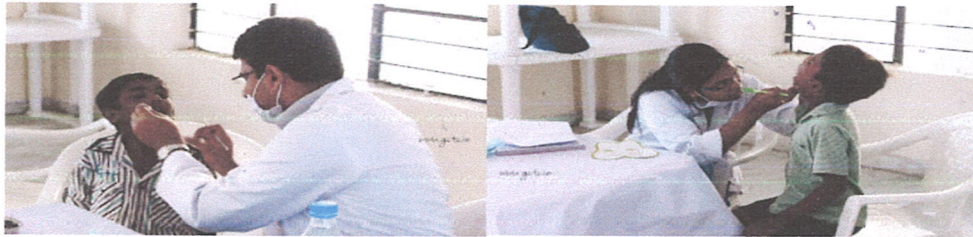
Dentists giving treatment to school students.

Geethanjali College of Pharmacy -NSS Units conducted "Dental Camp" at Geethanjali College of Pharmacy seminar hall block no I in collaboration with KJS Dental Hospital. The event is based testing the students of govt school Keesara. Doctor from KJS Dental Hospital treated more than 30 students. The event was grand success.