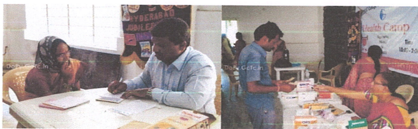
Consultation of physicians and distribution of medicines free of cost

Geethanjali College of Pharmacy -NSS Units conducted "Health Camp" at Geethanjali College of Pharmacy seminar hall block no I in collaboration with Govt Hospital Keesara. The main aim of the event is to give treatment for free of cost to the village people. Large number of village people gathered and the physicians also treated more than 50 patients and medicines were also distributed free of cost. The programme was grand success.