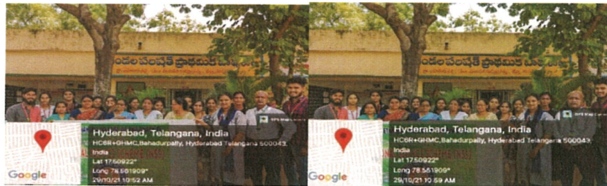
Our college student's interaction with high school principal

Geethanjali College of Pharmacy-NSS Units conducted "Adult Lad Primary Education" in Dundigal Municipality at 10.40AM on 29/10/2021. The students of B. Pharmacy IV year attended the event there was an interaction section with the students of high school regarding the higher education and interaction with school principal regarding the facilities required to be implemented in high school.