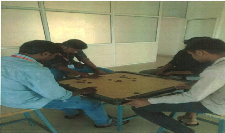
NATIONAL PHARMACY WEEK - CARROMS COMPETITION