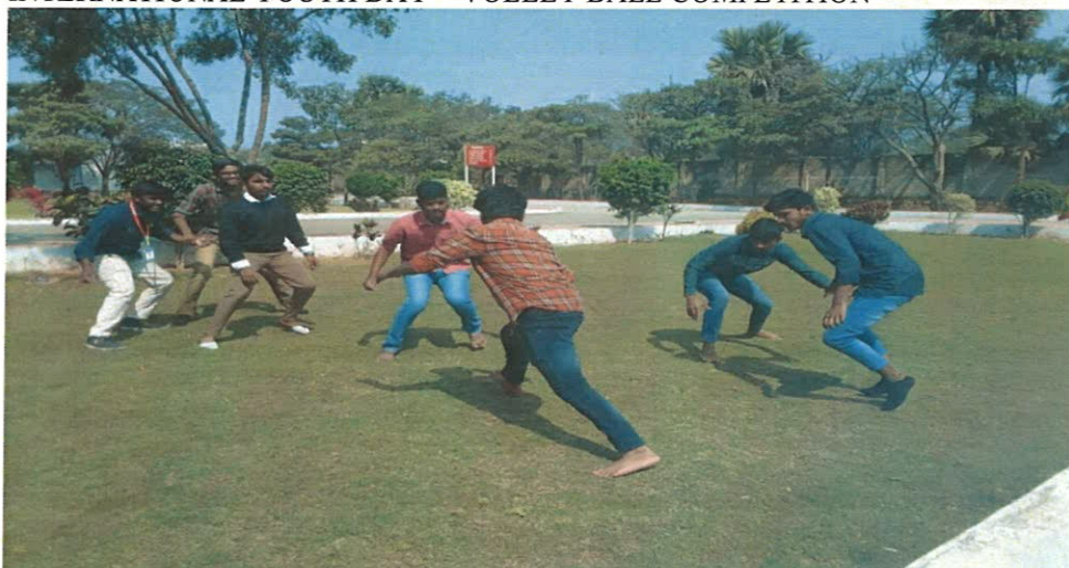
INTERNATIONAL YOUTH DAY – KABADDI COMPETITION