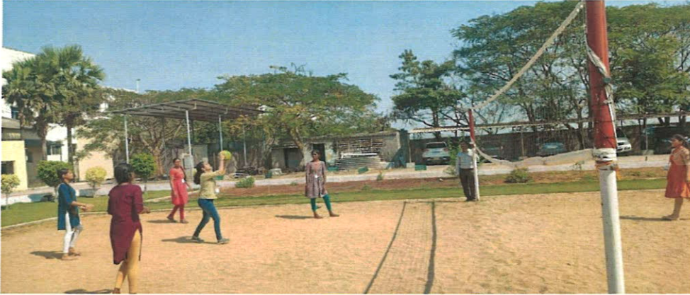
INTERNATIONAL YOUTH DAY – THROW BALL COMPETITION

Approved by AICTE, PCI New Delhi, Permanently Affiliated to JNTUH Cheeryal (V), Keesara (M), Medchal-Malkajgiri Dist., Telangana State- 501301