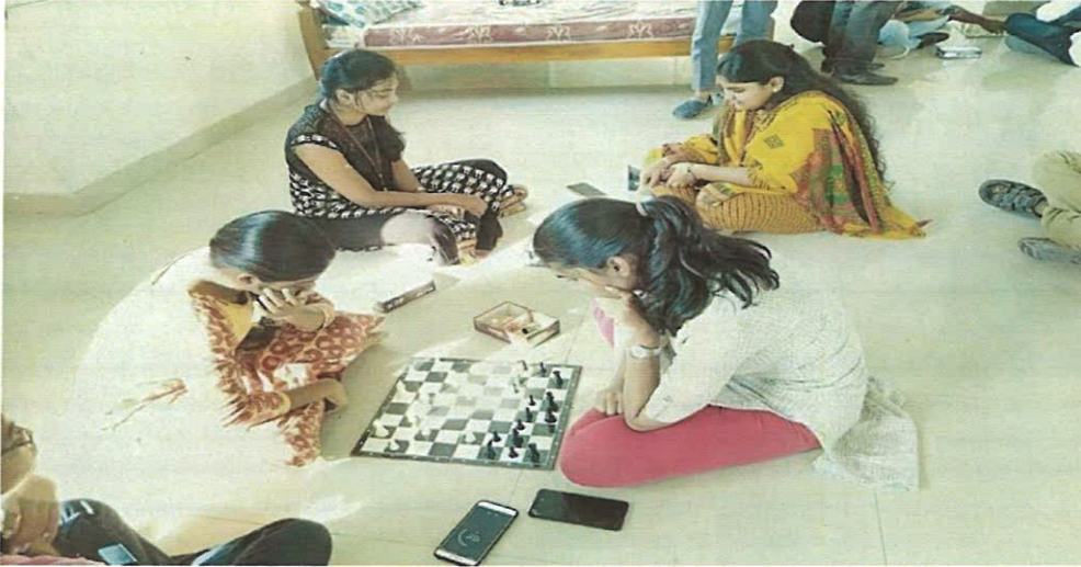
NATIONAL PHARMACY WEEK - CHESS COMPETITION

Approved by AICTE, PCI New Delhi, Permanently Affiliated to JNTUH Cheeryal (V), Keesara (M), Medchal-Malkajgiri Dist., Telangana State- 501301