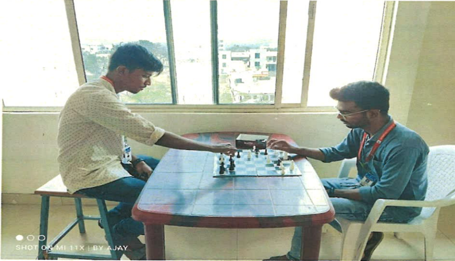
WORLD PHARMACIST DAY – CHESS

Approved by AICTE, PCI New Delhi, Permanently Affiliated to JNTUH Cheeryal (V), Keesara (M), Medchal-Malkajgiri Dist., Telangana State- 501301