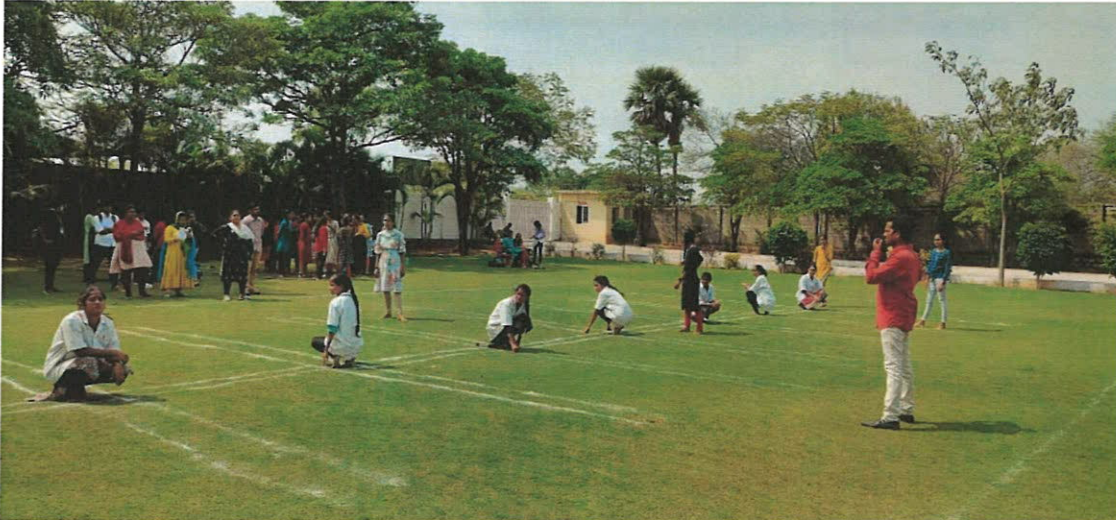
REPUBLIC DAY – KHO-KHO COMPETITION

Approved by AICTE, PCI New Delhi, Permanently Affiliated to JNTUH Cheeryal (V), Keesara (M), Medchal-Malkajgiri Dist., Telangana State- 501301