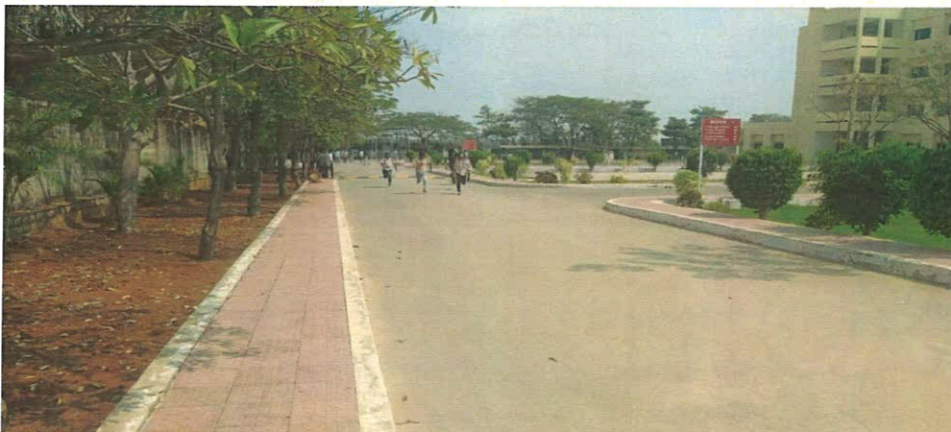
INDEPENDENCE DAY – RUNNING COMPETITION