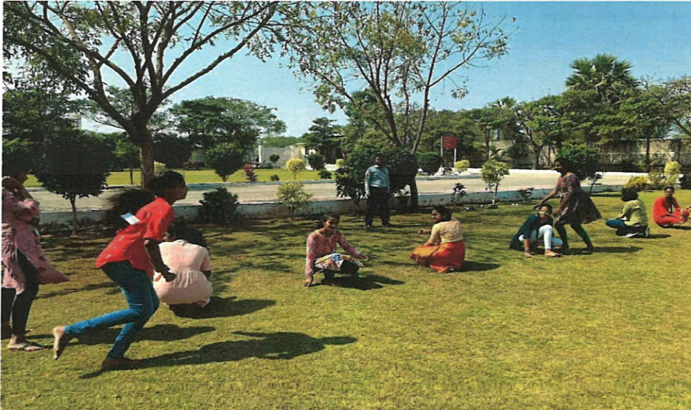
INTERNATIONAL YOUTH DAY – KHO-KHO COMPETITION