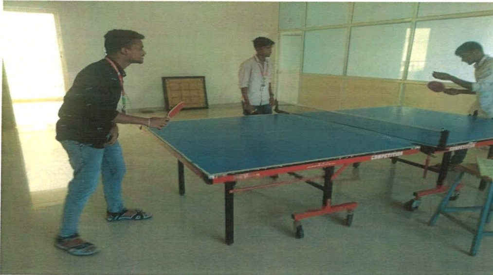
WORLD PHARMACIST DAY – TABLE TENNIS COMPETITION