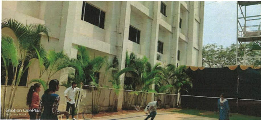
INDEPENDENCE DAY – BADMINTON COMPETITION

Approved by AICTE, PCI New Delhi, Permanently Affiliated to JNTUH Cheeryal (V), Keesara (M), Medchal-Malkajgiri Dist., Telangana State- 501301