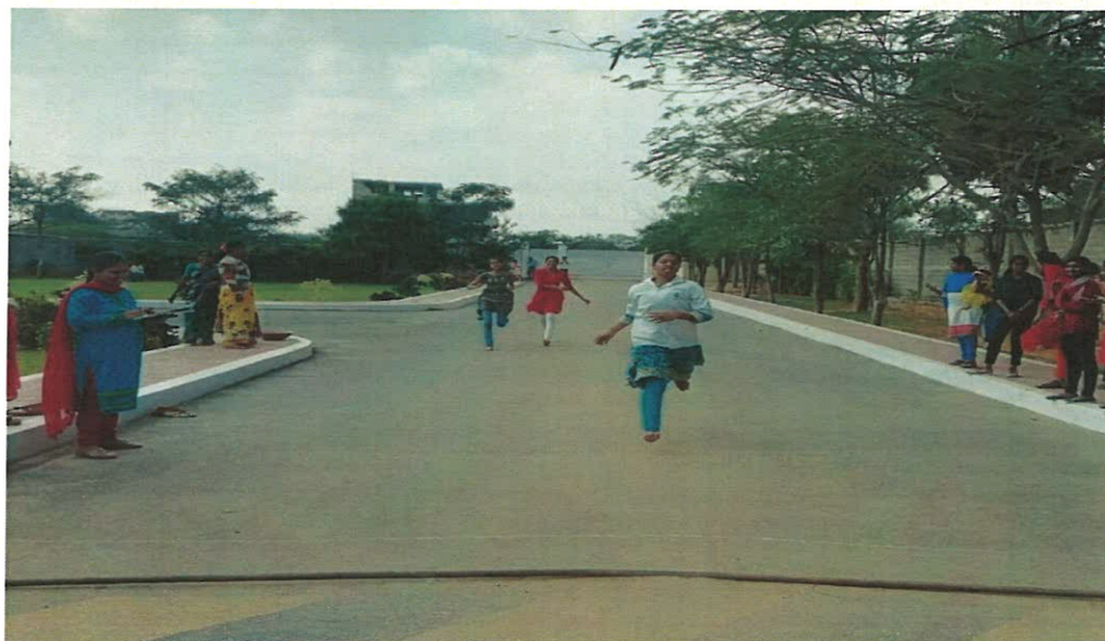
NATIONAL PHARMACY WEEK- RUNNING COMPETITION