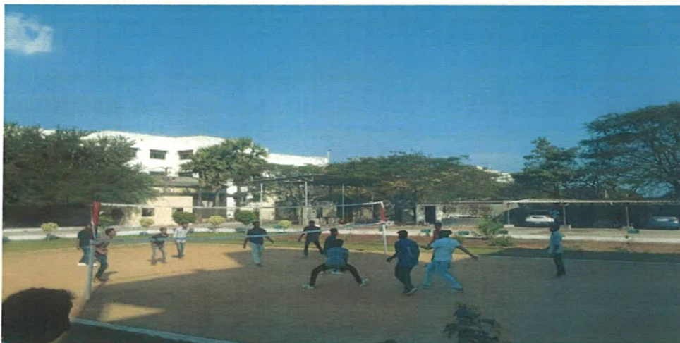
INTERNATIONAL YOUTH DAY – VOLLEY BALL COMPETITION

Approved by AICTE, PCI New Delhi, Permanently Affiliated to JNTUH Cheeryal (V), Keesara (M), Medchal-Malkajgiri Dist., Telangana State- 501301